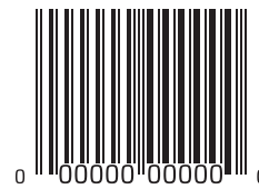
Minimum Size 80% reduction of Nominal Size